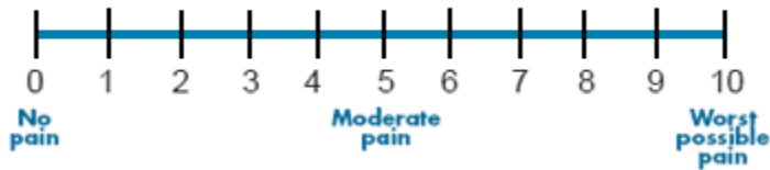
0-10 Numeric Pain Rating Scale

5. WHAT WAS YOUR INITIAL PAIN LEVEL BEFORE BEING TREATED AT THIS OFFICE? Please circle